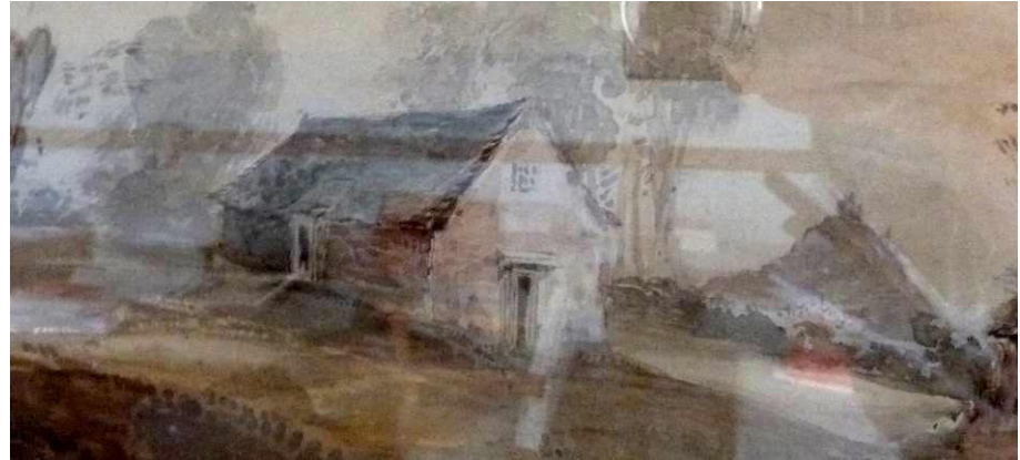
Figure 2: Detail from a nineteenth-century watercolour, showing the meeting house and St Michael's Mount (see photo top left on page 1 for a modern view) (Marazion Meeting House)