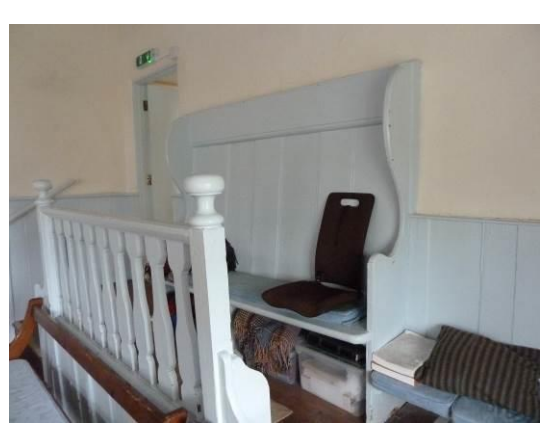
Statement of Significance

The meeting house at Marazion is the oldest purpose-built meeting house in Cornwall. Erected in 1688/89 on the site of an earlier burial ground, it was altered in 1742 and c.1880 and extended in 1961-62 and 2007. Features of note include the fine ministers' and elders' stand, and the historic sash windows. Overall, the meeting house has exceptional significance.